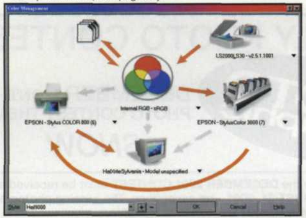
Above : CorelDRAW 10 provides a full color-management system for controlling the entire edit process.

located in the program. When you access any of the tools through theses menus, you will immediately be given the name of the tool and a small sample icon indicating the tool's function. To better help you through the learning process, the Corel programs feature both a tutorial and an excellent help database.